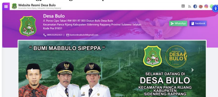
Figure 1. Front Page View of the Bulo Village Official Website

Bulo Village, located in Sidenreng Rappang Regency, has shown a strong commitment in realizing the vision of becoming a Smart Village. One of the important steps taken by the village government is the preparation of a participatory vision and mission, involving various levels of society. The active participation of village heads, village staff, and the public in village deliberations shows the seriousness of the village government in responding to local needs and potential. The vision of Bulo village, which includes the concept of a smart village and an emphasis on the agriculture, plantation, and livestock sectors based on “ Mabbulo Sipepa ” local values, reflects efforts to integrate tradition and technology in village development.