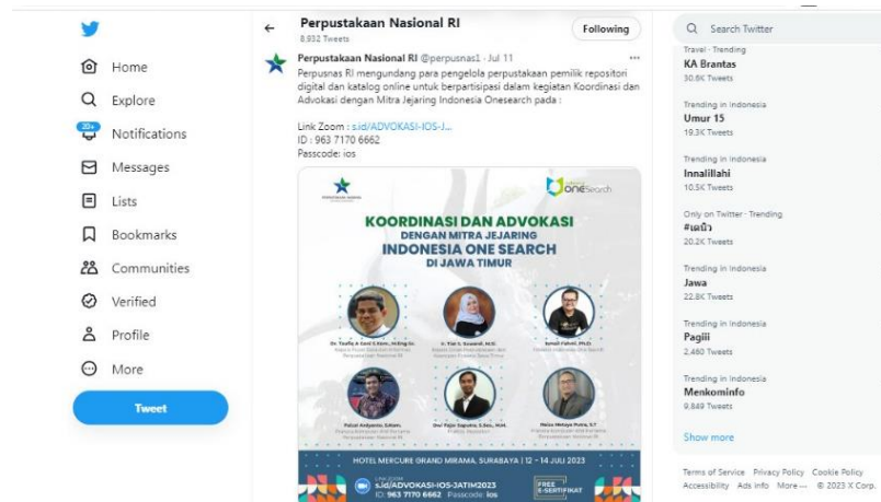
Figure 3. Information Dissemination Analysis @perpusnas1

The strategic alliance formed by these accounts exemplifies the power of interconnected platforms in advancing digital literacy. By fostering followers who eagerly seek out information and actively engage with these accounts, the foundation for a knowledgeable and informed online community is laid. This collaborative endeavor not only amplifies the reach of individual accounts but collectively strengthens the digital literacy landscape in Indonesia.