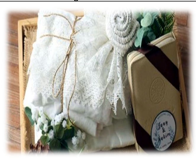
Figure 4. Women's Clothing Seserahan

d. The maning of Women's Clothing Seserahan