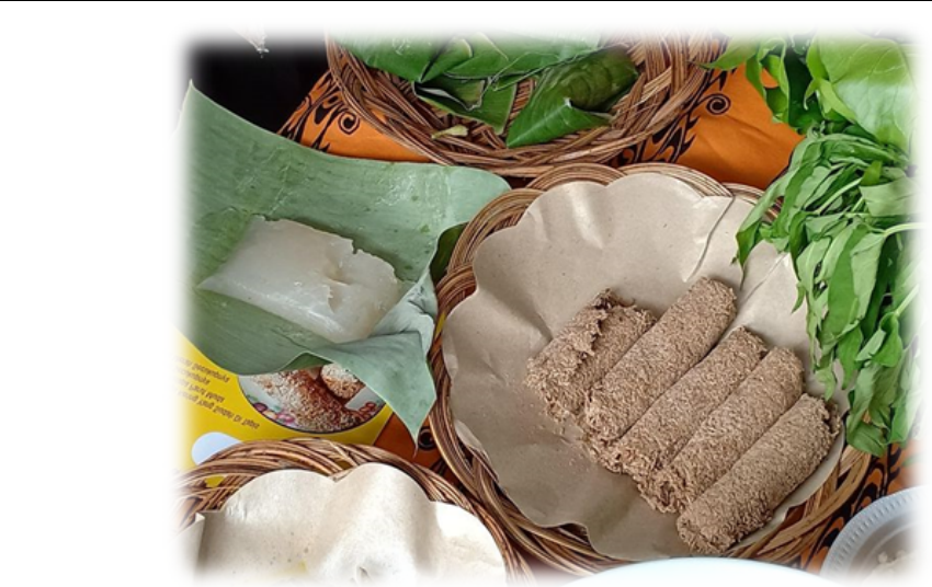
Figure 5. Traditional Food and Fruit Symbols

e. Meaning of Traditional Food and Fruit Symbols