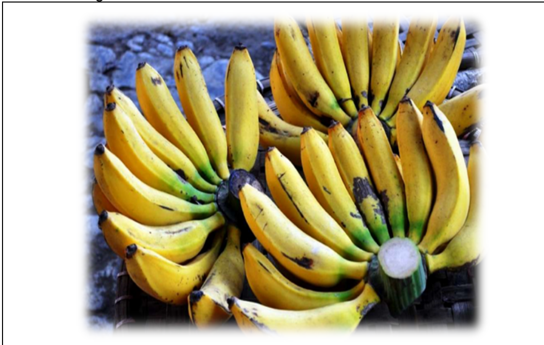
Figure 1. Banana as a part of Serah-Serahan

In the Serah-serahan, the sanggan banana is chosen from the plantain (a banana that tastes good, smells good, and lasts a long time, even though the skin is dry it is still delicious and ripe). The bananas were chosen to be large, clean, and ripe bananas. It contains the hope of happiness. Plantains contain the meaning of hope that the life of the bride and groom can be happy like a king and empress, giving a sense of good/happiness to others.