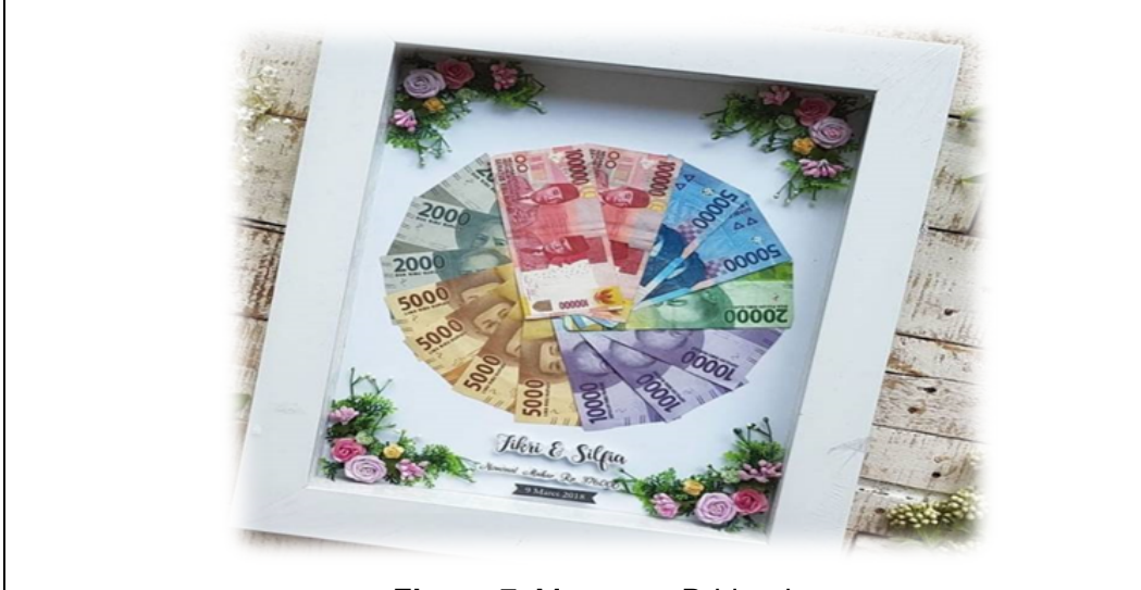
Figure 7. Money as Brideprice

Giving some money from the groom to the bride can be interpreted as a contribution and a form of accountability for the groom to the bride to ease the burden and costs of the wedding.