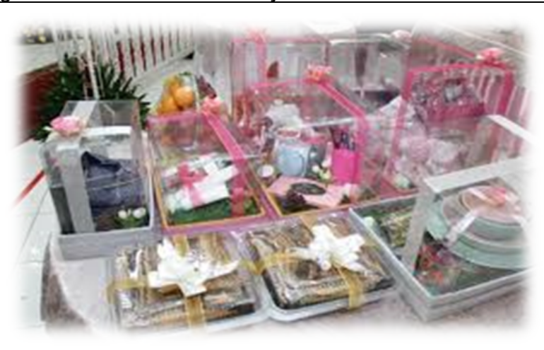
Figure 6. Household Furniture Symbol

In the application procession on the island of Hunt, household furniture is the groom's obligation to be handed over to the bride, this symbolizes that navigating the household ark must have preparation and maturity so that the meaning of this furniture is interpreted as a complement to fostering a family.